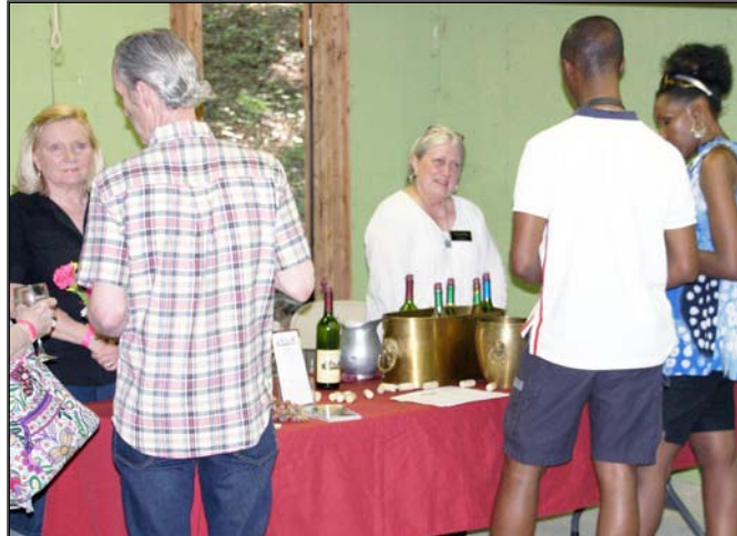
Festival goers enjoy a taste of wines from regional vineyards. wineries in the area now, and as more continue to come in, we'll see more tourism specifically geared toward wine and

Hightower Creek Vineyards and Crane Creek Vineyards, being the two from Towns County, acted as host vineyards for the event. "The last three years