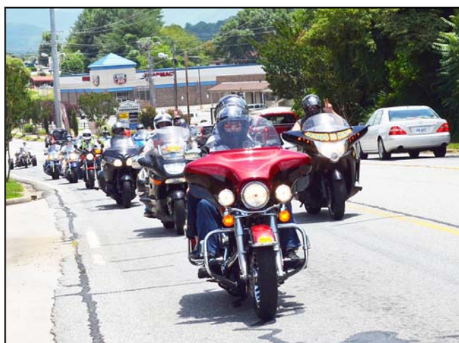
Saturday's CMA Parade included 150 motorcycles.