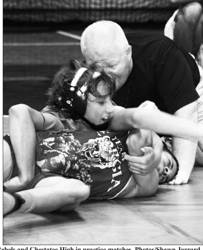
Rebels and Chestatee High in practice matches.