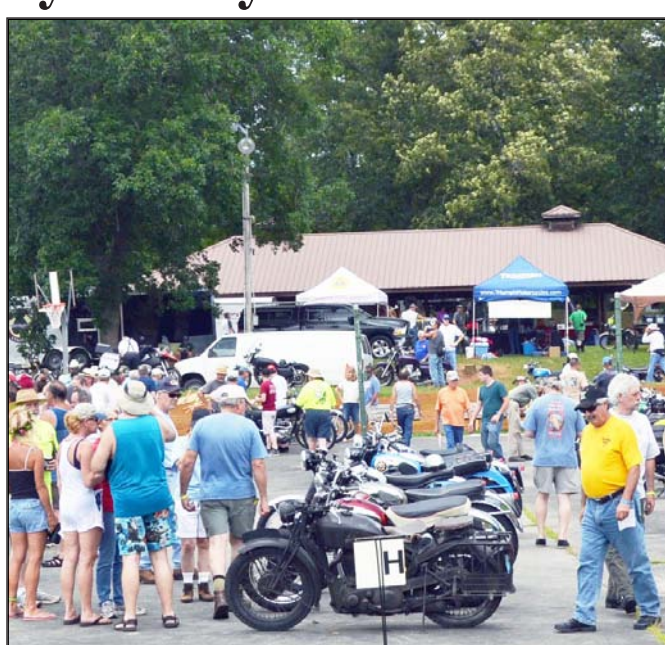
British motorcycle enthusiasts flocked to the Georgia Mountain Fairgrounds over the weekend.

Vendors set up on Friday at the Fairgrounds, where registration for the events took place, kicking off the three-day