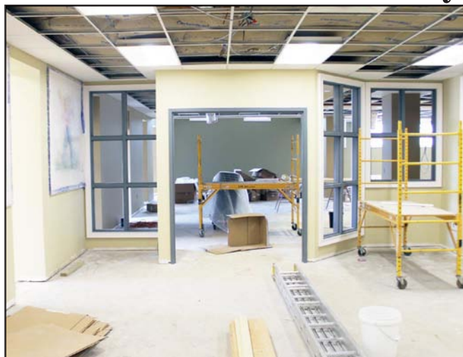
Construction continues at the soon-to-be open Towns County Library in Hiwassee.

"This is the fastest growing library in our region and we just ran out of space and needed more room," she said.