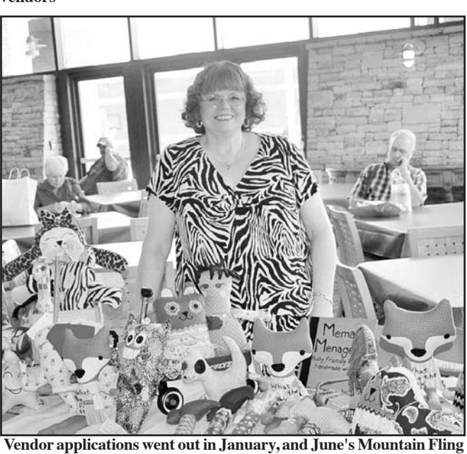
and November's Mistletoe Market quickly filled up. A few tables are available for September's Celebrate Autumm show. Photo by