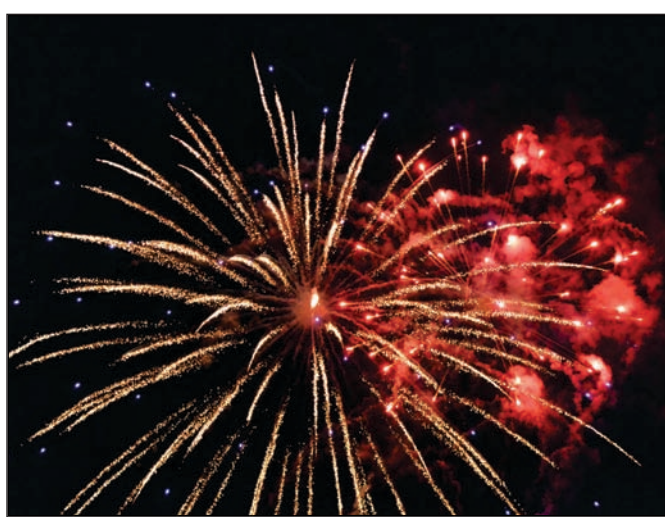
The Saturday evening skyline was bursting with beautiful colors as the Georgia Mountain Fairgrounds hosted its annual Fireworks Display.

She knew if she could get 20 minutes of dry weather, she