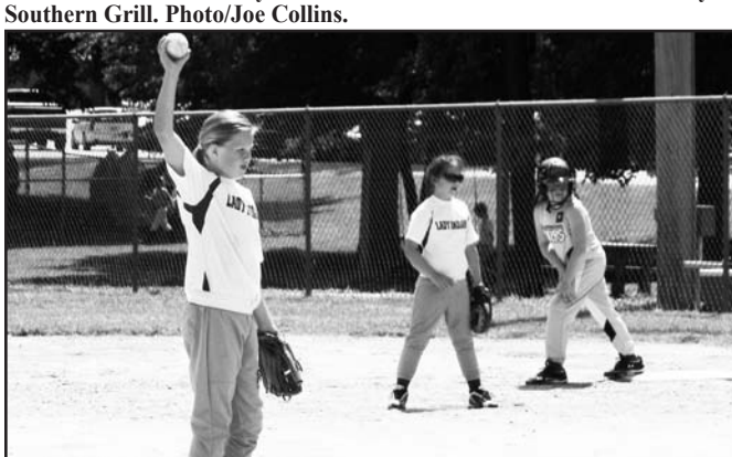
TCRD 10&U in action during the District Tournament.

are good in the field and they can produce a lot of runs at the plate."