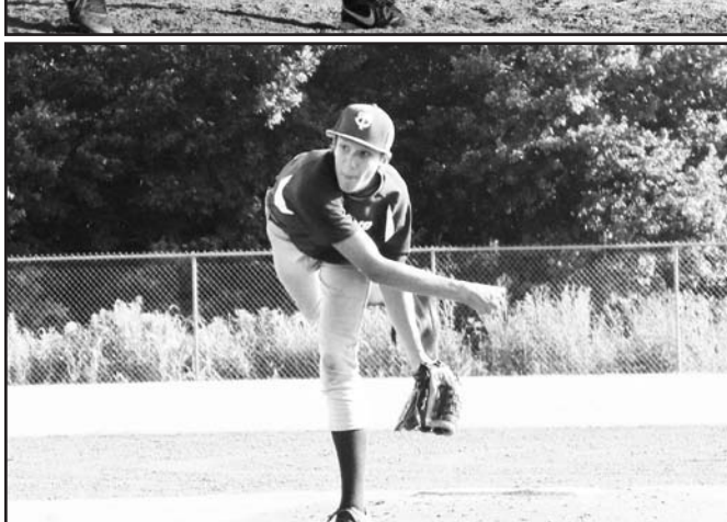
Towns County 14&U

choose teams from and we have one. It really says something about this group of boys when they go in there and beat these big programs. This team has very few weaknesses."