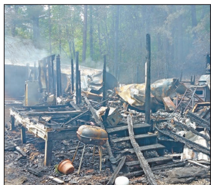
A mysterious blaze in the early morning hours of July 6 burned this mobile home to the ground off of Matheson Road. According to the renters, two dogs perished in the fire.