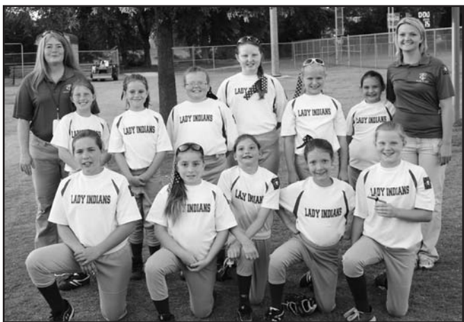
Towns County 10&U Softball