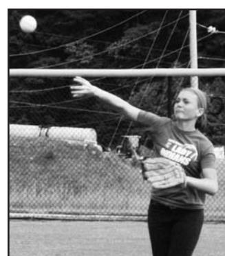
The Towns County High School Lady Indians took part in Summer League games at Union County last week, and on Monday. Their contest with Fannin was rained out during the second inning and the Union game was canceled. Towns went back to Union on Monday to face the Lady Rebels and the Lady Panthers again.