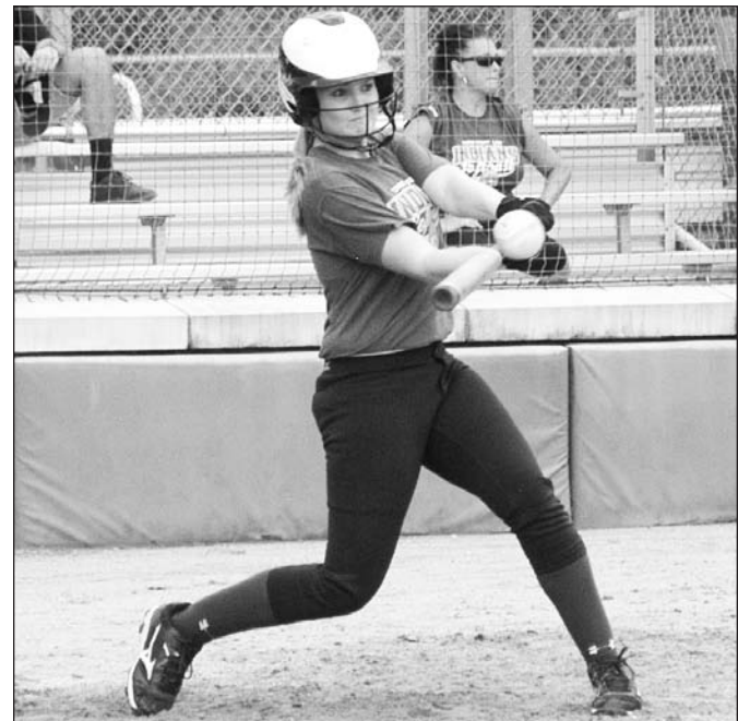
Lady Indians at Union County last Tuesday.