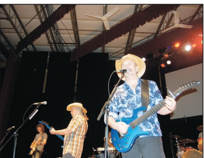
The Bellamy Brothers once again proved crowd favorites at Anderson Music Hall during the Georgia Mountain Fair.

Rock-N-Roll. Following next came Anderson Music Hall favorite The Bellamy Brothers, also made up of a brother duo, consisting of Howard Bellamy and younger brother David Bellamy. The Brothers Bellamy performed and put on a great show as they sang the songs that made them Pop and Country Music icons. They opened with Feelin' the Feelin' and Let Your Love Flow . The fans were singing along, clapping their hands, and even some folks were dancing in the aisles. The Brothers have been performing together for almost 40 years and have withstood the test of time and they still have that magical blend of instrumentals and sound that keep fans coming back for more. Possibly their all time greatest hit, If I Said You Have a Beautiful Body (Would You Hold it Against Me) , sent fans into a frenzy. Bellamy Brothers' fans were on their feet, clapping, and absolutely showing these very talented brothers their love and appreciation of their enduring musical talent.