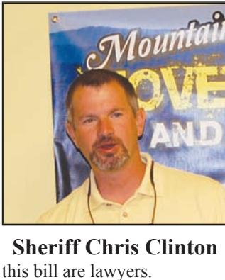
'It's the attorneys of the

The crowd was in unanimous agreement that the only