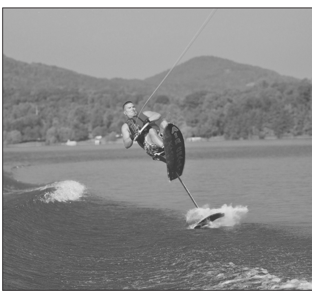
Hydrofoiling comes back to Lake Chatuge for the eighth consecutive year at the Ridges Resort & Marina this weekend. It's here Thursday through Sunday.

If zipping across, or just above, the waters of North Georgia and North Carolina while strapped to a wing seems like a good time, then a day at the Ridges & Marina Resort on Lake Chatuge should be a part of your plans Thursday through Sunday. That's when the Eighth Annual Georgia Mountain Fly-In will be showcasing many of the world's best sit-down hydrofoil athletes as they come together to show off the latest tricks, entertain the thousands of visitors that will show up to watch, and teach the sport to anyone interested in learning how it's done. The Ridges will be really the hot spot to be as the Fly-In will kick off on the same day as the Georgia Moonshine Cruiz-In Haulin' Mash Bash on Thursday. You are definitely in for a double whammy of a treat. For those of you not familiar with the sport of sit-down hydrofoiling, you owe it to yourself and your family to come out and participate or just enjoy watching as the well-trained athletes show you how it's done. Sit-down hydrofoiling is a relatively new sport in which riders are strapped in a seated position on a board atop a hydrofoil wing and towed by a ski boat. As the rider gathers speed, the hydrofoil acts as a wing in the water and lifts the board and the rider a foot or more above the surface of the lake. "They break world records while they're here,"