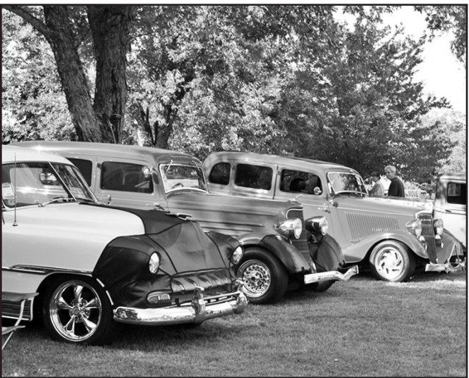
The Moonshine Cruiz-in features classic and muscle cars from all over the country. This is the fourth year the Cruiz-In has been featured in Towns County.