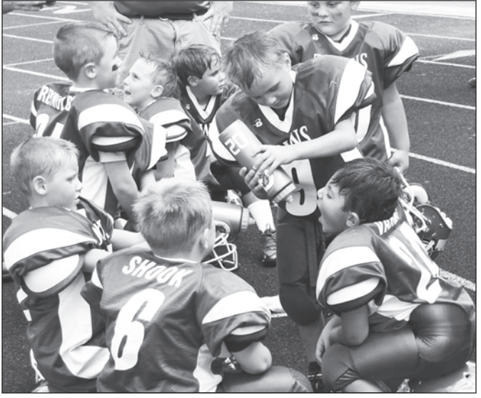
The Towns County youth football players and cheerleaders are the future of Towns County. Not only on the gridiron but as fine young men and women in the community.

The next match in Robinsville is a bye for the Towns County Midgets, as the Robinsville Midget team doesn't exist. Two weeks of practice before their next game should help the Midgets come