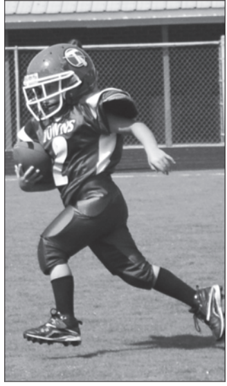
The Towns County youth football players and cheerleaders are the future of Towns County. Not only on the gridiron but as fine young men and women in the community.