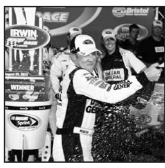
Matt Kenseth, winner of Bristol Cup race

Kurt Busch started off leading the race, but a vibration problem forced him to make an unscheduled pit stop on lap 77. He took four fresh tires but the problem persisted and eventually, he had to bring his car behind the wall for his team to replace the damaged hub in the right rear