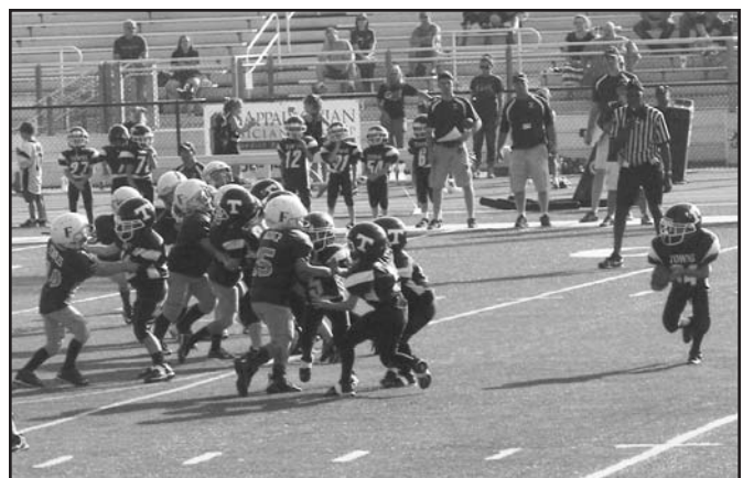
Towns County Youth Football League

"We're just going to get better," he said confidently. "We've got a lot of good looking kids out. It's going to get better for us. We are the only Class A school in our league. It makes a big difference. We're just going practice hard and get better."