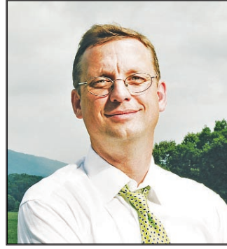
U.S. Rep. Doug Collins

According to his website, Rep. Collins said, "Giving parents the ability to choose safe and effective schools will