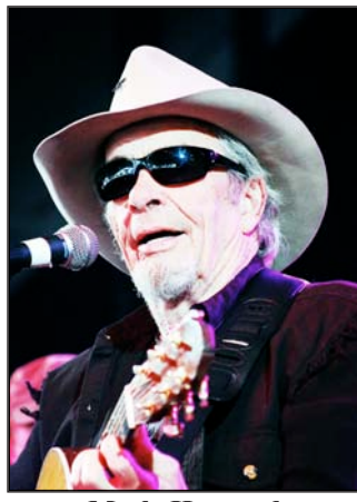
Merle Haggard on a compact disc or a soundtrack. A guitar or accompaniment is permissible.

Contestants (no age requirements) must bring music