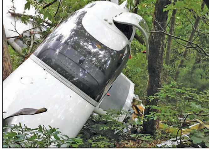
This DA40 four-seater wasn't far from the Towns County line.