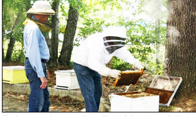
The Beekeeping Institute at Young Harris College is one of a kind.