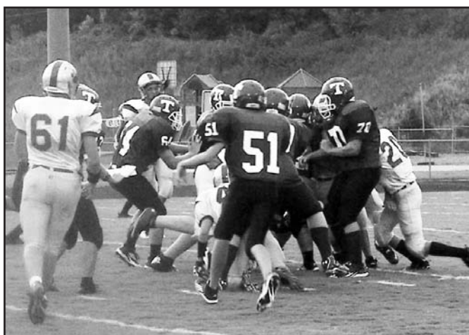
Towns County hosted the Cougars in the first JV game in five years.

The Indians were showing some promise as they mounted a solid drive going on their last possession of the half. The offense picked up a couple of first downs on the back of some really solid blocking by