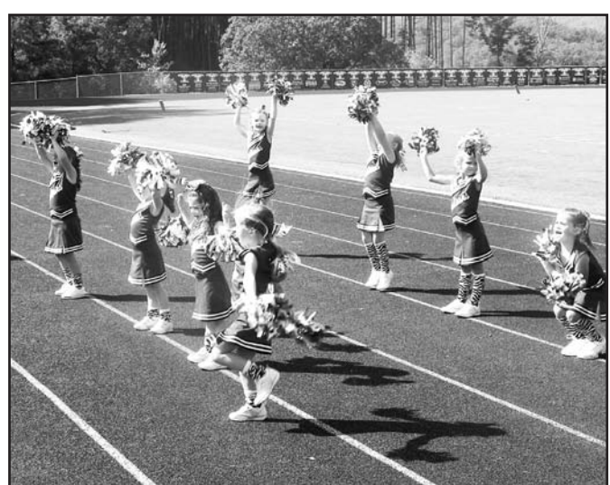
Towns County Indian Cheerleaders urge spectators to support their team.

The YFL is proving to be an excellent training ground for the younger kids in Towns County and the coaches are doing a wonderful job. If you are interested in traveling to the games next Saturday simply go to ngyfa.org for the schedule.