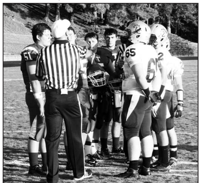
Team captains before kickoff. Union won the toss and deferred.

Come out and support the Indians' football team, as they just keep getting better. Go Indians!