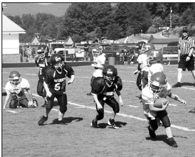
A Towns County back avoids Warrior defenders in last Saturday's action.

The offense moved the ball on the ground really well and the front line blocking kept the Warriors defense in check. The first Touchdown of the game was actually a pass play