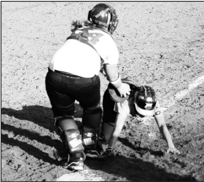
Towns County makes the play at the plate.