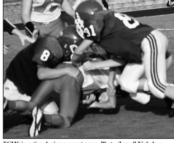
TCMS in action during a recent game.