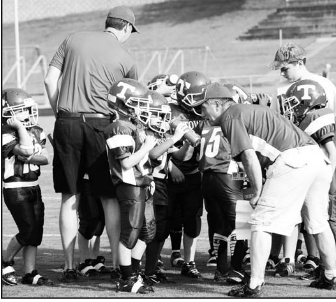
Towns County's Youth Football teams during a game at TCHS.

Despite the score, Towns was able to execute a number of plays that highlighted the talent of their young athletes. As expected,