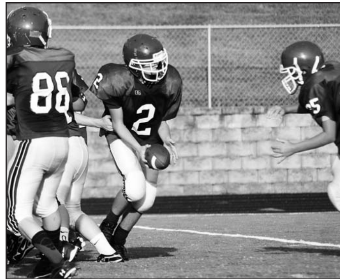
TCMS in action during a recent game.

On Thursday they travel to Dahlonega to face off against Lumpkin County.