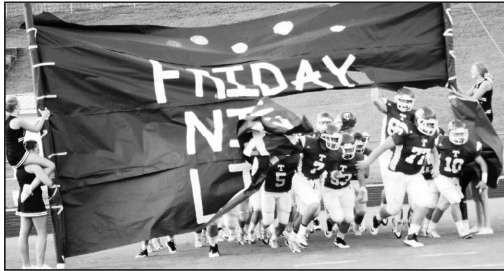
Towns County takes the field. The Indians will be at home again this week when they face neighboring Rabun County, who is likely the toughest opponent of the 2013 season.