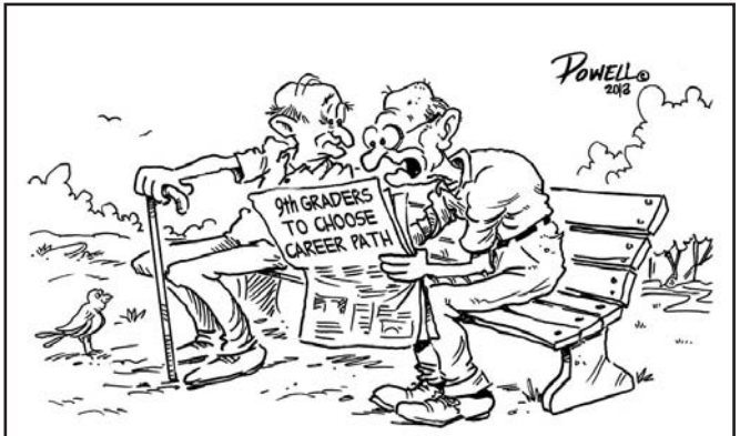
"I wish they'd had this career path stuff back when we were in school. I still don't know what I want to be when I grow up!"

Send your parenting questions to: DrDon@RareKids.net.