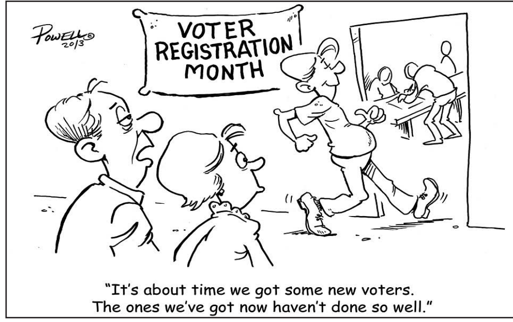
"It's about time we got some new voters. The ones we've got now haven't done so well."

Jesus said, "Follow Me and I will make you fishers of men." (Mark 1:17).