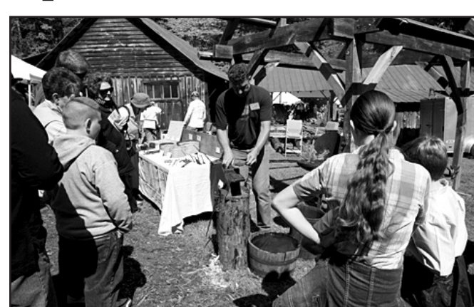
A blacksmithing demonstration draws a crowd at the Folk School's annual Fall Festival, scheduled for Oct. 6 & 7, 2012.

Just a stone's throw from the John C. Campbell Folk School, the Murphy, NC Art Walk keeps the town's streets humming with art and crafts-focused activities. Visitors are invited to mingle with two dozen local artists on the