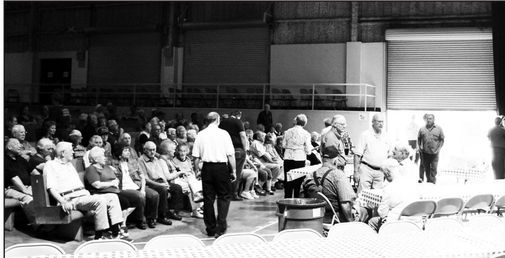
A good time was had by all at the Georgia Mountain Fair picnic to honor volunteers.