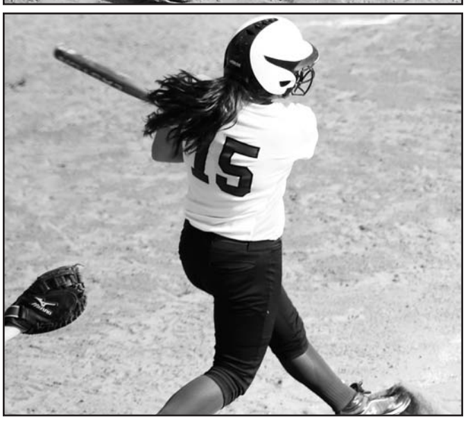
Towns County Lady Indians pounded out seven runs in their win over Hebron Christian Academy last week.

than they had in previous games. pens whenever she doesn't Our defense was better this some things we need to work on fence homerun. in the outfield."