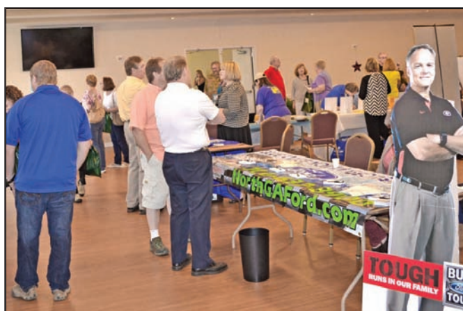
The First Business Showcase draws a crowd.

Blutworth stood outside the conference center, where a bouncy castle, a face-painting