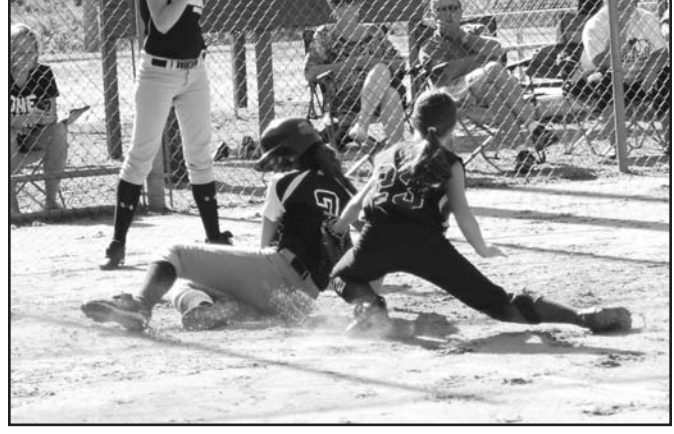
TCMS Softball playoff

that she was excited about having young new athletes to mold.