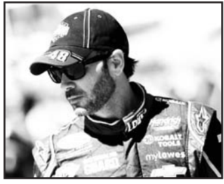
Jimmie Johnson, winner of Dover Cup race

BIG STAR Ryan Blaney is on the threshold of making it into NASCAR's Sprint Cup.