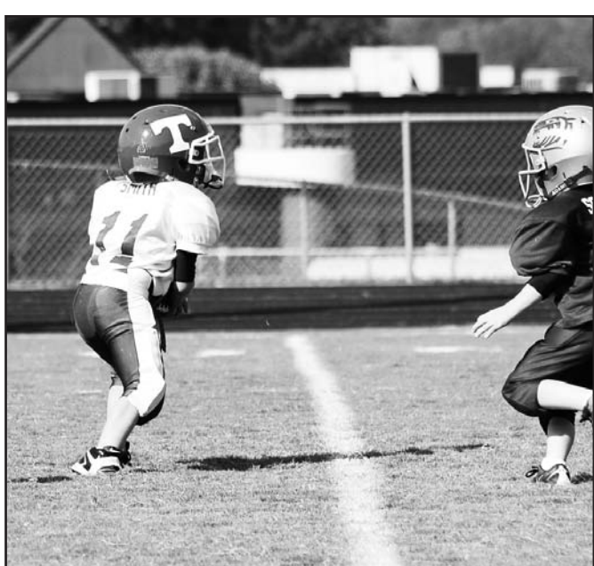
Looking for some running room during a recent youth football game.