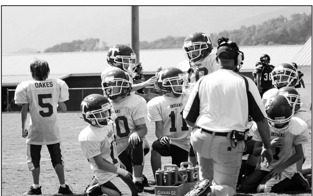
Towns County takes a break to hydrate and discuss strategy with the coaches at a recent game.