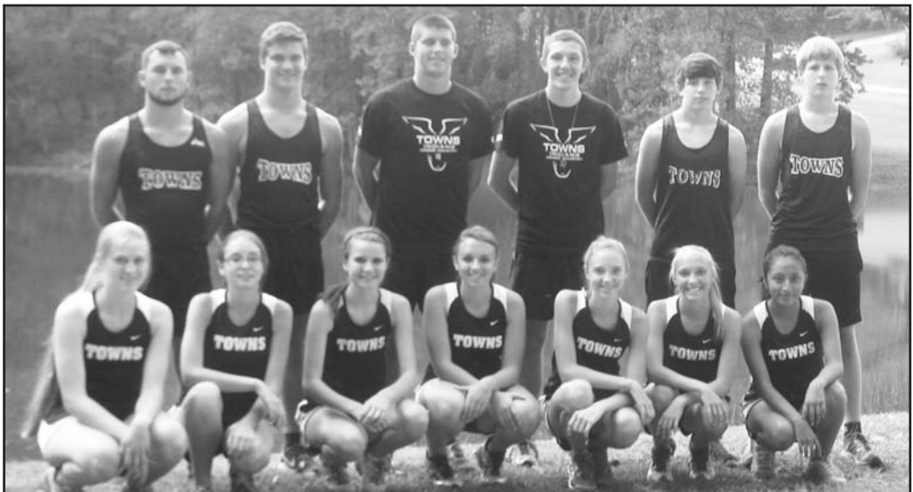
Towns County's Cross Country teams at the Fannin County Rec Department last week.