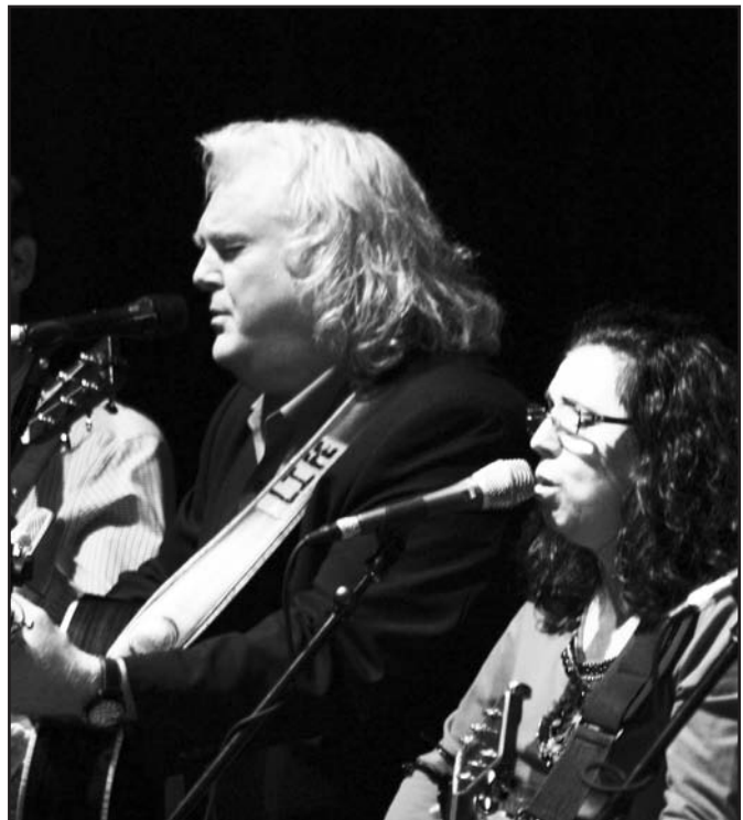
marriage. “Every song on it has a real purpose and a meaning for us,” said Skaggs. “We’ve

Heart Like Ours debuted this year on Sept. 30, and Skaggs couldn’t be more pleased with how representative the selection of songs is of his and White’s marriage. “Every song on it has a real purpose and a meaning for us,” said Skaggs. “We’ve