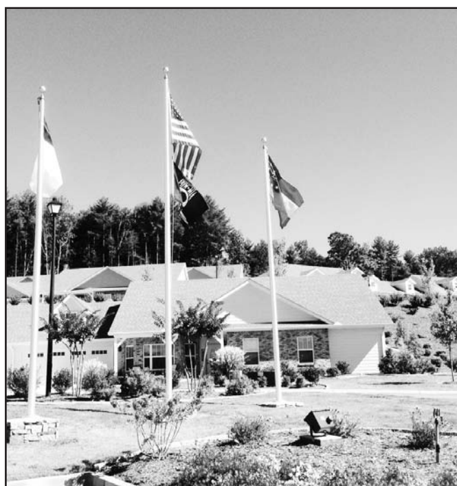
The flags flying high at Hiwassee Park.

Also receiving thanks were Ken and Flo Gerrard,