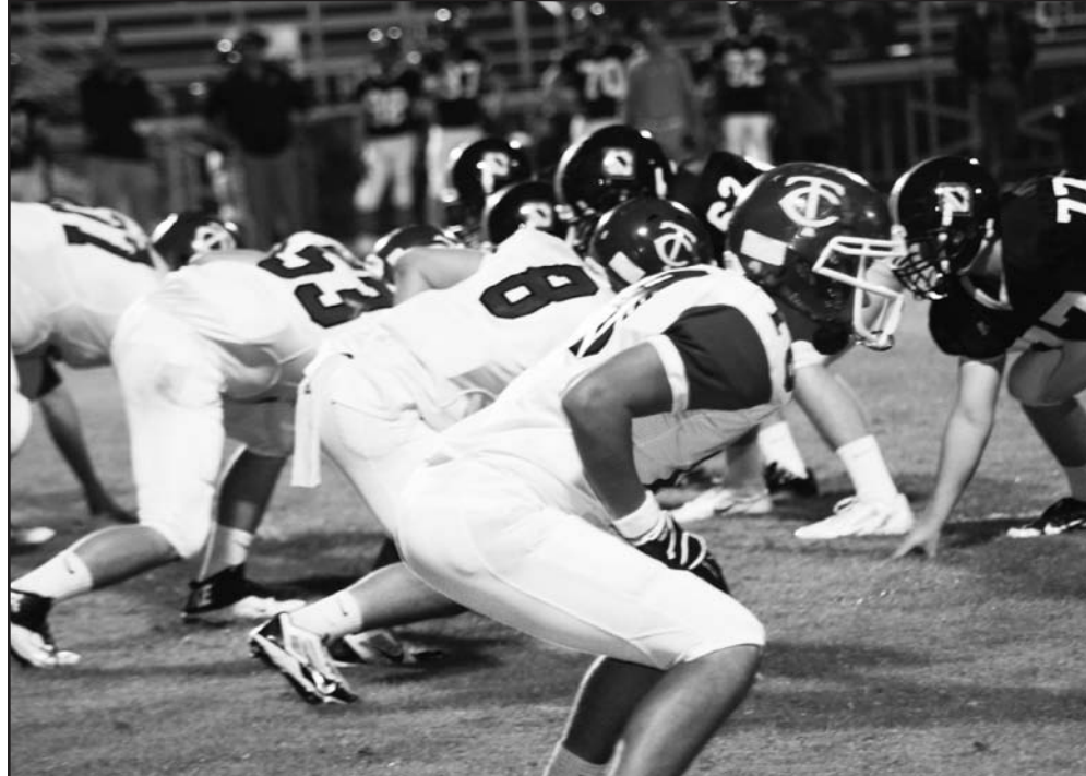
The Indians defense has held the opposition to 18 points in its last two games.