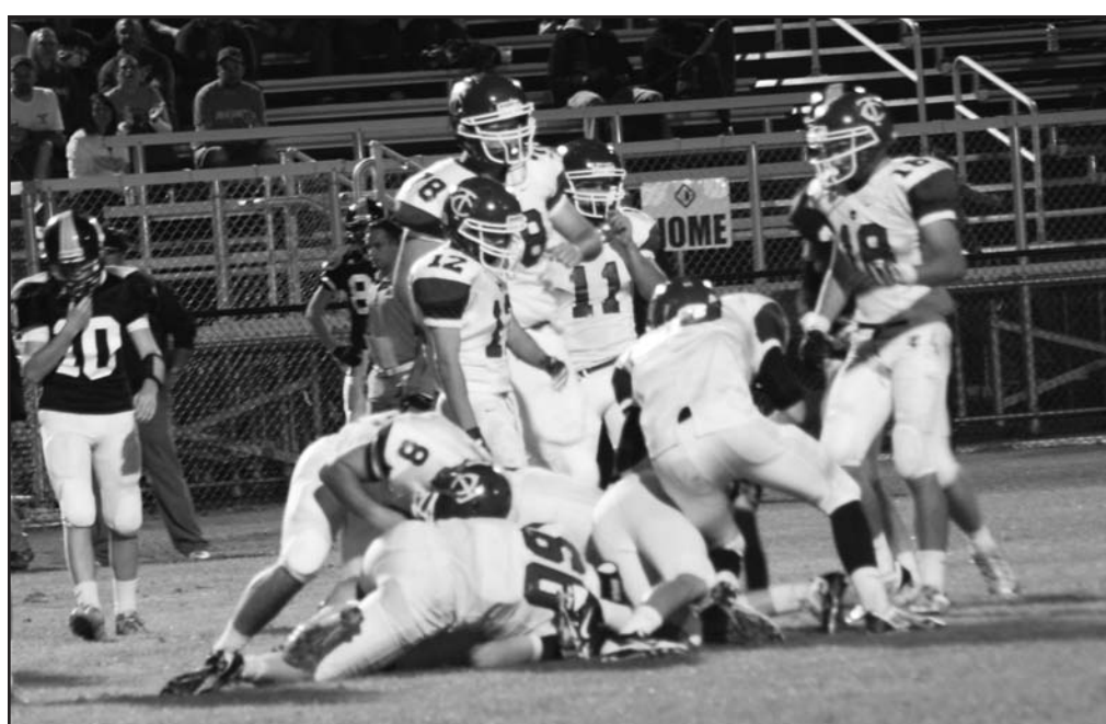
The Towns County 'bend but done break' defense refuses to bend on this play.