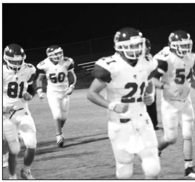
Towns County exits the field as the victor for the second time this season. The first time on opposing turf.