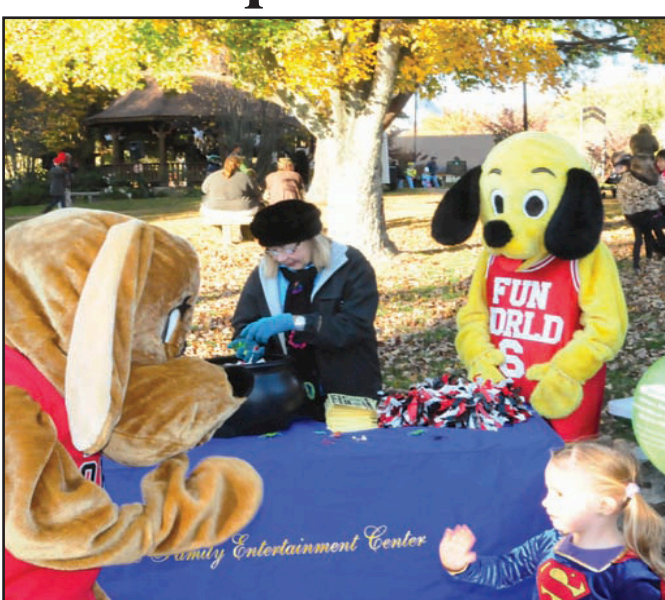
Expect the Funworld mascots to be on hand for Halloween On the Square.