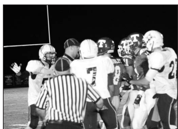
Friday nights are alright for fighting too.

The final few minutes was a tough time as the Indians defense had to fight hard to control a late quarter charge from the Knights. They managed