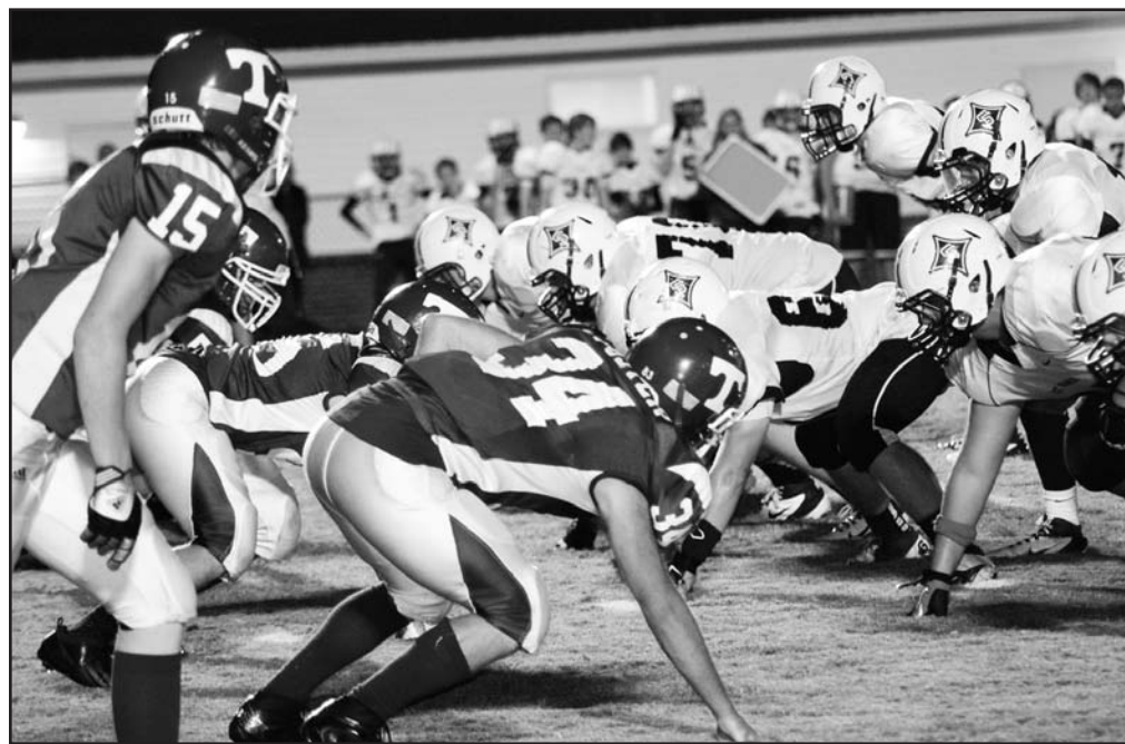
The TC defense held their ground during a critical two-point conversion for back-to-back wins. The Indians go for three straight on Friday for the third time in TCHS history.