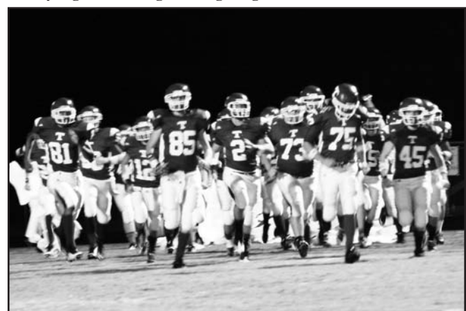
The Indians take the field.

to score with 45 seconds left on the clock and pulled within two points of the Indians 35-33. The two-point attempt would tie the game and the Indians knew what they had to do. Some good defense on a short pass play by the Knights kept the ball out of the receiver's hands and the Indians had their second win of the season in the bag.