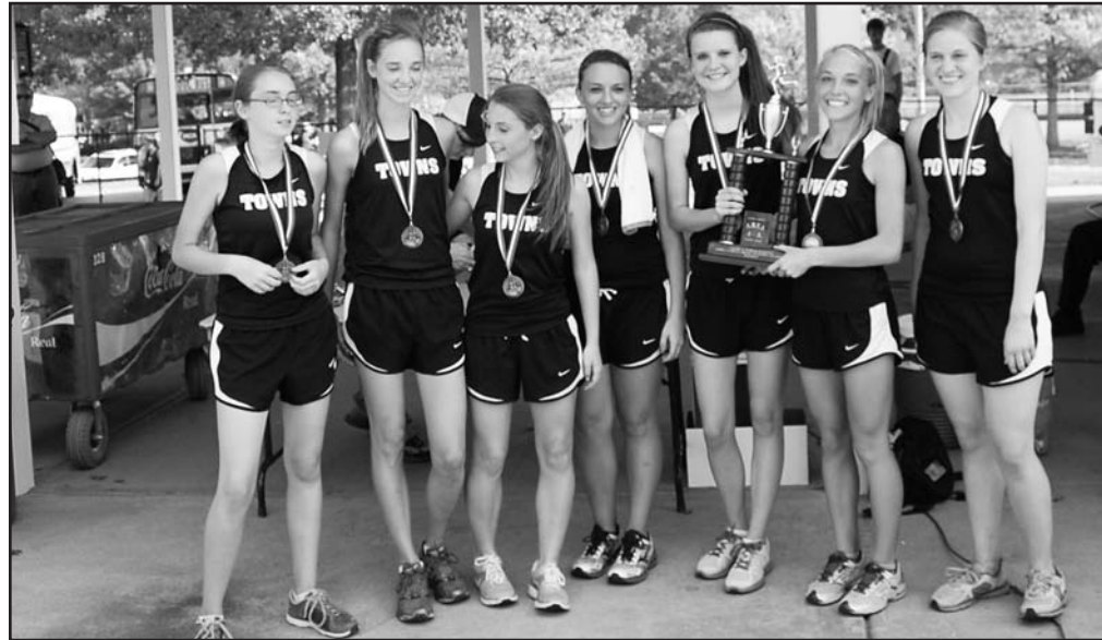
Towns County Lady Indians take home first in last week's Area Meet.