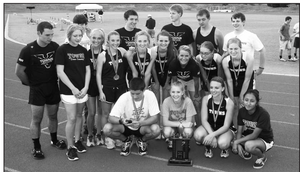
Both teams celebrate their performance at the Area Championships.