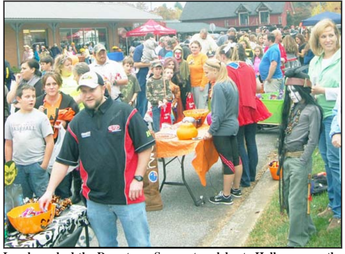
Locals packed the Downtown Square to celebrate Halloween on the Square in Hiawassee.