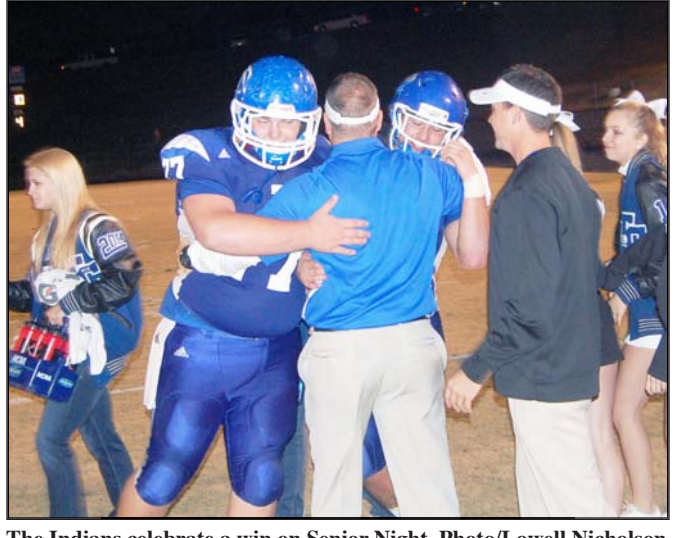
The Indians celebrate a win on Senior Night.