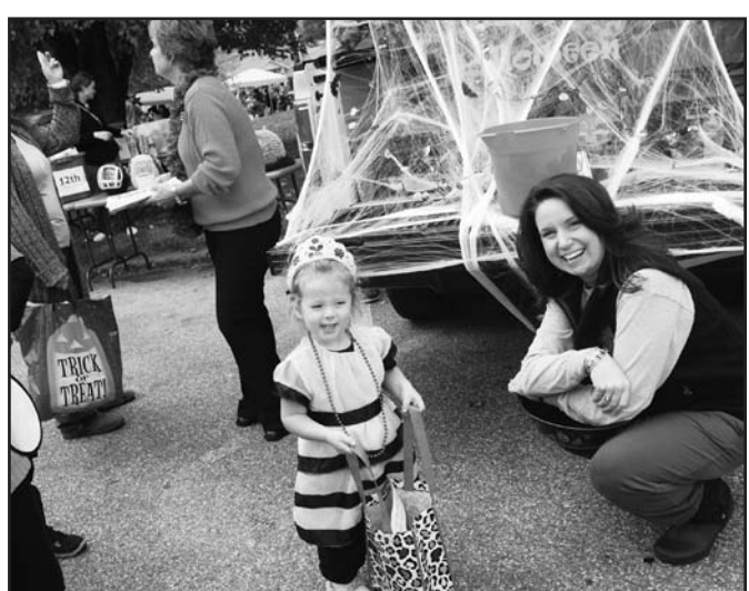
Halloween on the Square in Downtown Hiawassee was fun for this young lady.