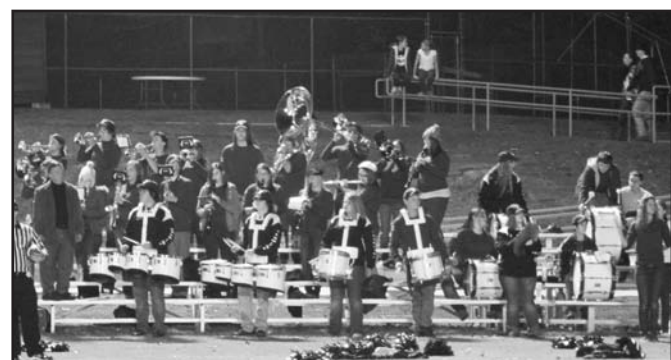
The TCHS Band at Lakeview.