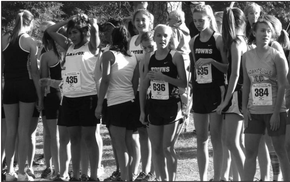
The Towns County Lady Indians' "Fast Five" at the starting line of the State Meet in Macon last weekend.

best and it is hard to find better runners as a whole than right here in this area," she said.