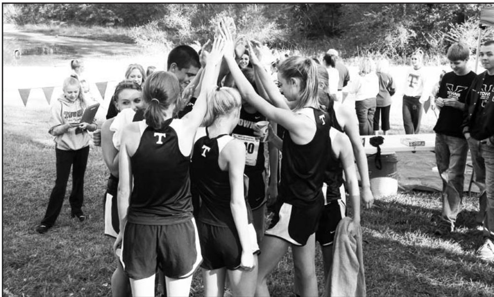
All Towns County's runners huddle and motivate each other before the race.

"I set up our schedule so that we could run against the