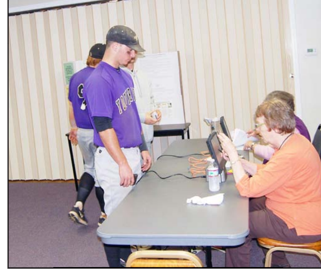
Even the Mountain Lions were casting ballots in the Young Harris City Council race in the Nov. 5th General Election.