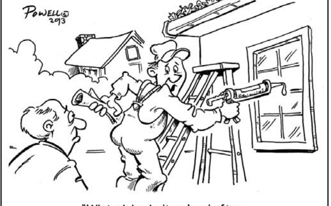
"Winterizing isn't so hard after your wife shows you last year's heating bills."