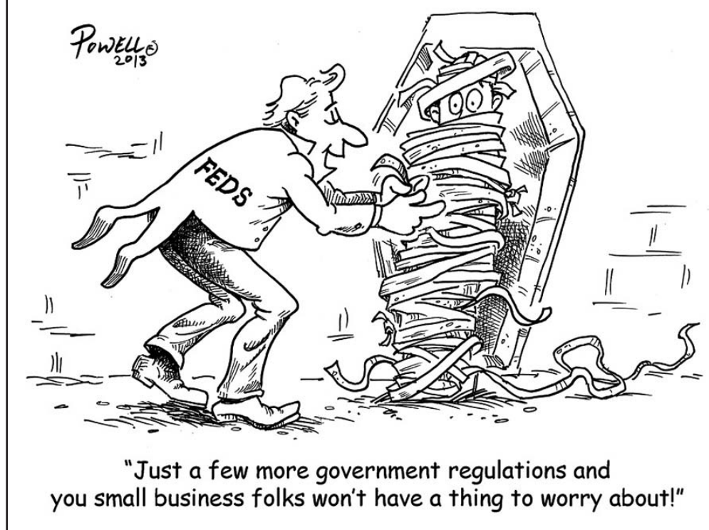
"Just a few more government regulations and you small business folks won't have a thing to worry about!"

"When Jesus called me into this army I had nothing. If I end up with nothing I will still come out ahead. If I win my God is the reason, and He will continue to supply all of my needs. I am more than a conqueror. I will always triumph. I can do all things through Christ. The devil cannot defeat me. People cannot disillusion me. Weather cannot weary me. Sickness cannot stop me. Battles cannot beat me. Money cannot buy me. Governments cannot silence me, and hell cannot handle me. I am a soldier! Even death cannot destroy me. When my commander calls me from His battlefield He will promote me to captain and then allow me to rule with Him. I am a soldier in the army, and I am marching, claiming the victory. I will not give up. I will not turn around. I am a soldier marching heaven bound. Here I stand! Will you stand with me?"