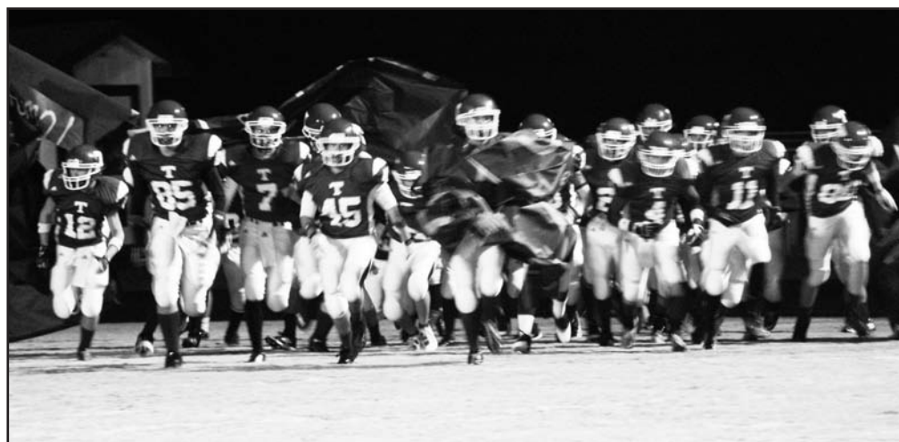
The Towns County Indians take the field for the final in 2012.