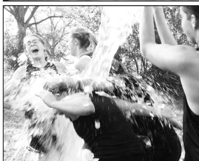
Towns County Cross Country celebrates its State Championship