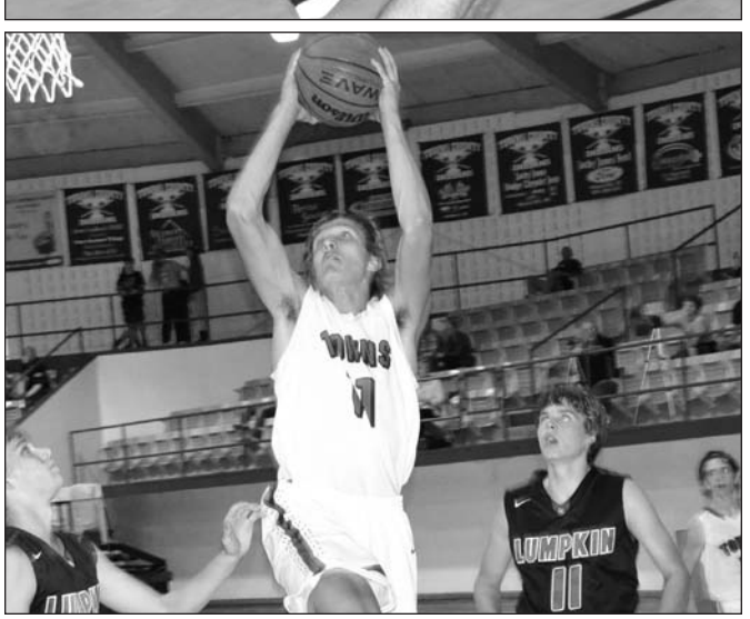
Indians vs Lumpkin County

sophomores, and three freshmen for the Indians.