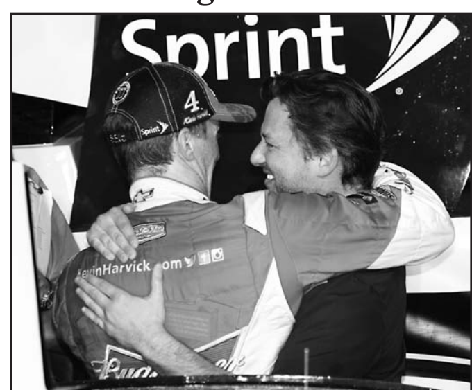
Kevin Harvick hugs car owner Tony Stewart after winning the 2014 Sprint Cup championship.

Such was the case with Jeff Gordon and his team during the latter part of the Homestead Cup