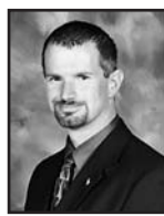
Sheriff Clinton of Towns County