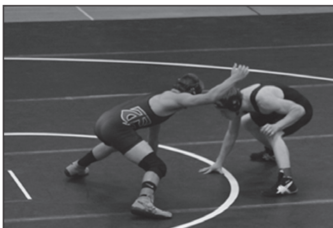
TCHS Wrestling opened on Tuesday, Nov. 27th

"Practice is going very well right now but I am concerned about some of the guys who are still nursing injuries from the fall sports. The team is coming along and we will get a good measure of how far we have come and how far we need to go when we see Dawson County on Tuesday before the