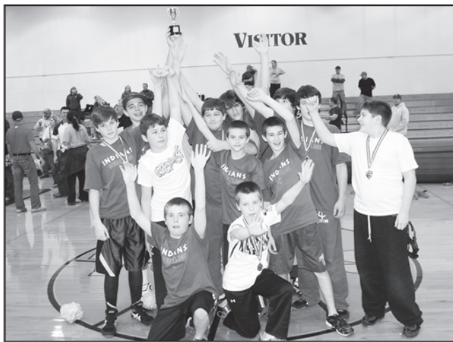
The TCMS Middle School wrestlers celebrate their third place finish at the King of the Mountain.

Nine other team members medalled in their respec-