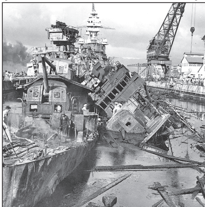
The wreckage of the U.S.S. Cassin and U.S.S. Downes on Dec. 7, 1941 following the Japanese Attack at Pearl Harbor.

"All we had, really, was radio and news," said Johnson. "Not like we have complete coverage with television and