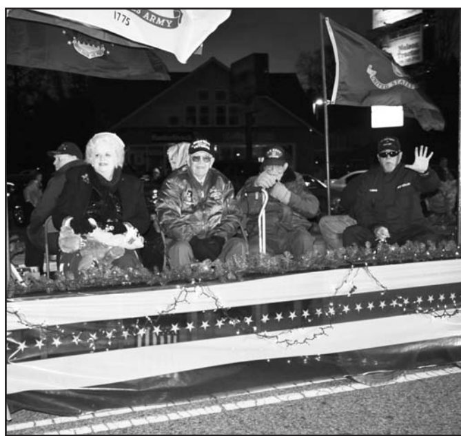
Towns County Veterans got in on the act on Saturday.

The parade floats were all be decorated according to this year's theme, "Christmas at Home," and as the sheriff's department assured, all parade floats were