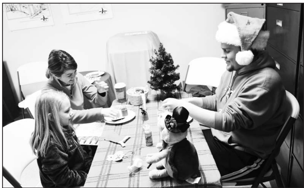
It was a weekend to remember at the Reece Farm and Heritage Center in Choestoe.