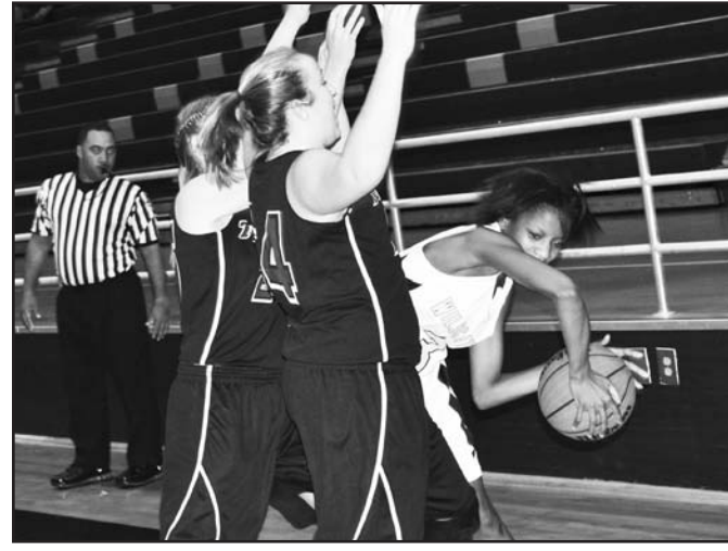
The Lady Indians trap a Lady Wildcat.