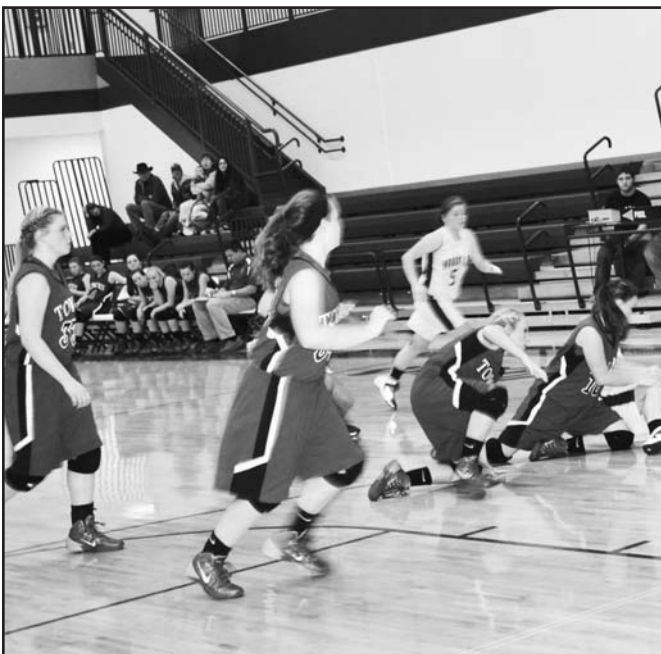
The Lady Indians JV squad goes after a loose ball at Woody Gap.