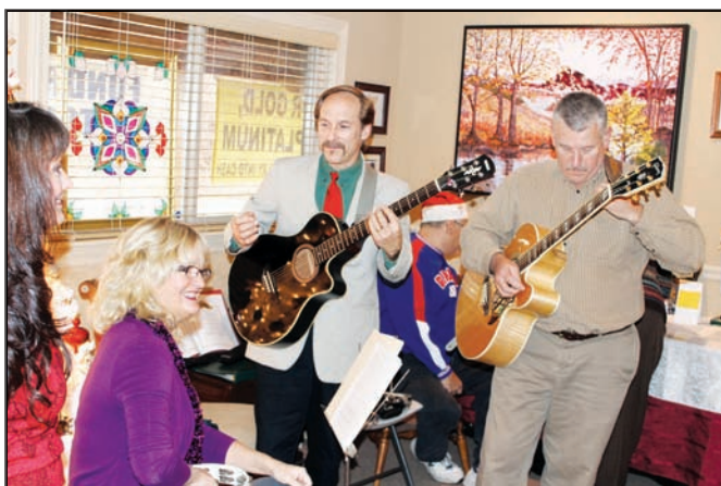
The Gold Academy Empty Stocking Fund toy drive was complete with Classic music from the Rock era.