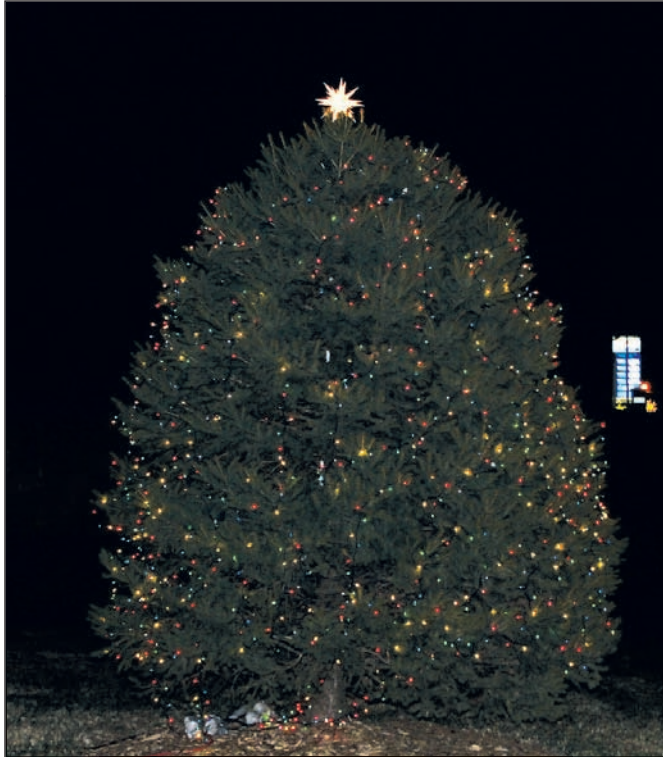
The annual lighting of the Chatuge Regional Love Light Tree warmed the hearts of many.