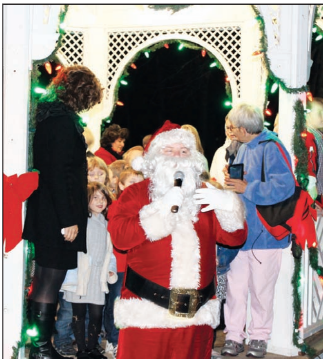
Santa Claus addresses the crowd on Friday at Mayor's Park in Young Harris. He said he was aware that Towns County children had been nice, not naughty in 2012.

But, the children were not very interested in the snacks. They were eager to get close to Santa Claus and tell him how good they had been and what they wanted him