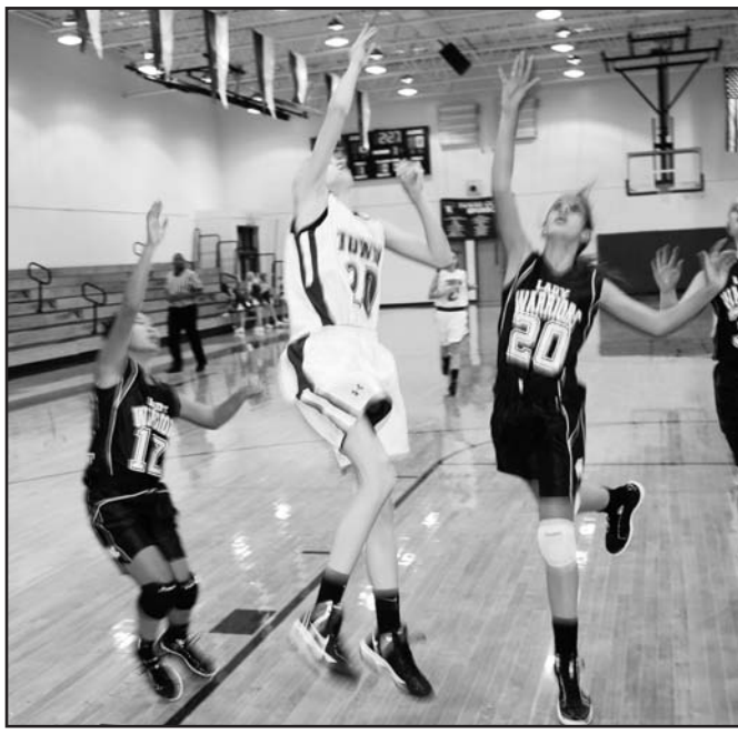
TCMS' girls going for two against White.

"We weren't hitting our shots underneath and that really hurt us. We had trouble moving the ball against their press and the missed oppor-