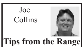
Tips from the Range

Make plans now to come out and see some good wres-