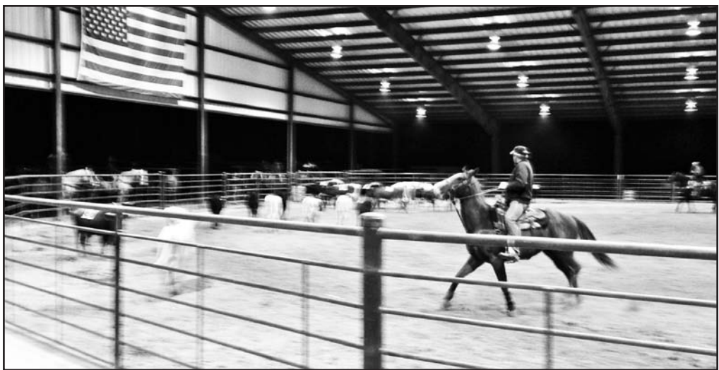
Top, the winners of the County Mounties first annual Rodeo; bottom, live action at the Rodeo. The County Mounties are a volunteer based association who ride their well-trained horses to provide security, assist in search and rescue, provide community service, and participate in parades.