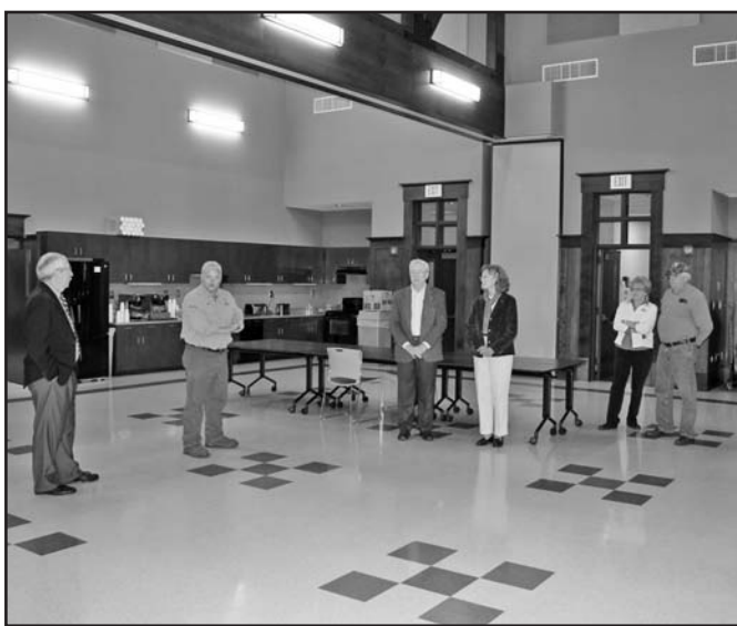
The Grand Tour was available last week at BRMEMC facilities.

The BRMEMC has cut the cost of water purchased from the City of Young Harris by up to 50 percent; a daylight harvesting system using clerestory windows provide natural lighting into the open office