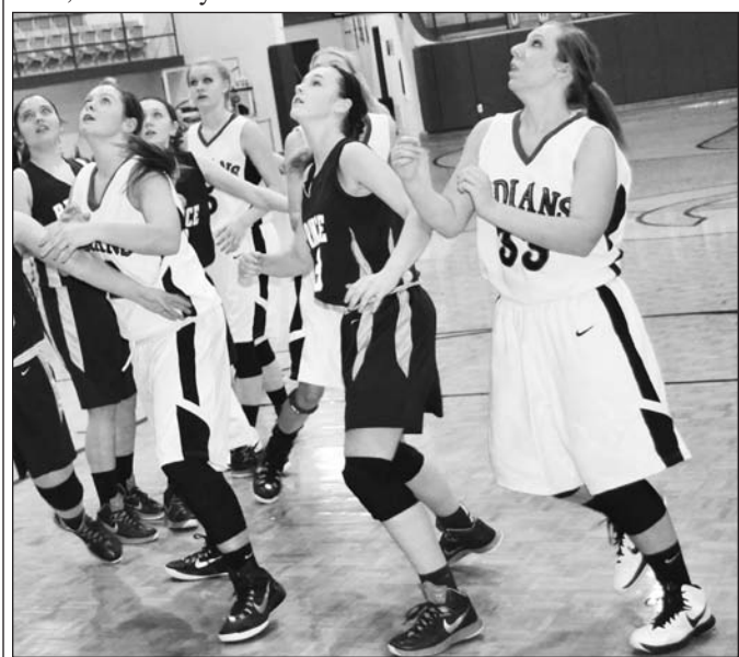
Lady Indians JV in action earlier this year.