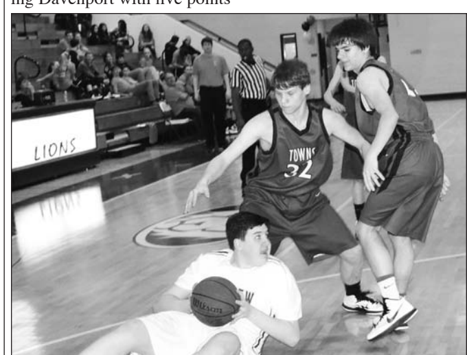
The Indians JV in action at Lakeview Academy.